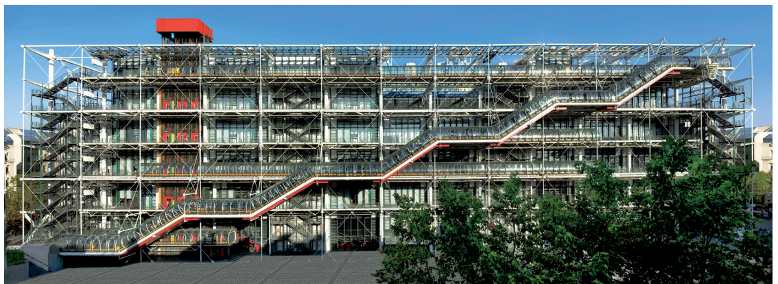
Centre Pompidou, Renzo Piano & Richard Rogers Architects

The Centre Pompidou has thus successively and successfully launched the Centre Pompidou Málaga in Spain (since 2015 and renewed in 2020), KANAL-Centre Pompidou Brussels in Belgium (since 2018) and the Centre Pompidou x West Bund Museum Project in Shanghai, China (since 2019). The Centre Pompidou x Jersey City project will be the Centre Pompidou's latest and newest form of international partnership, the first ever to take place in North America. Scheduled to open in 2024, at a time the Paris building will be undergoing its most ambitious upgrade since 1977, and while an abounding program of events will be deployed in France and worldwide, this new location in the United States will again prove the Centre Pompidou's ability to constantly and consistently reinvent itself, investing in new territories, always imagining new ways for the Arts and Culture to meet the people, everywhere.