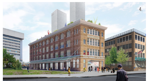
1. & 2. Exterior views from the "Pathside" Building, 25 Sip Avenue 3. Interior view 4. 3D Rendering